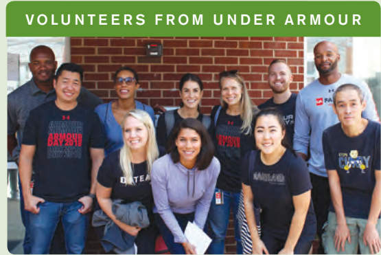
VOLUNTEERS FROM UNDER ARMOUR

We know that time commitments prevent some individuals from volunteering on site at Paul's Place. If you can't give your time, please consider giving gently used clothes for our Marketplace or food for the holidays. You can contact Jack Elsnes (jelsnes@paulsplaceoutreach.org) for more information about our specific needs.