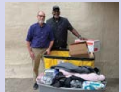
Baker Donelson donation of coats

A kid walking to school. A woman waiting at a bus stop. A man with inadequate shelter. Freezing temperatures are a serious danger. You can warm the heart and body of a neighbor in need! We are still short of our goal of 500 winter coats by the end of December! Cold-weather clothing, hats, gloves, scarves, and boots also are in demand. Visit paulsplaceoutreach.org/donate/ for guidelines, links to our Amazon wish lists, or to schedule a drop-off.