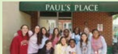
Garrison Forest School