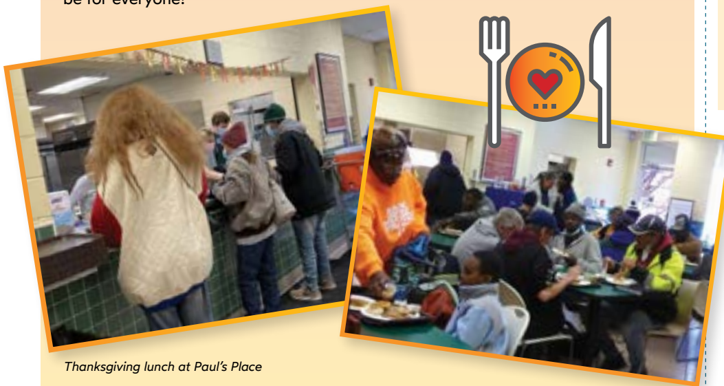
Thanksgiving lunch at Paul's Place