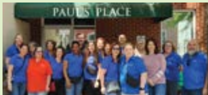
Becton Dickinson (BD)